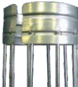
Split top collar