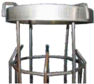
Hookey top with support ring

Our dust collector filter cages are carefully fabricated and sized to ensure ease of installation and removal.