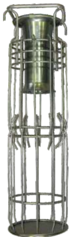
Cage with venturi