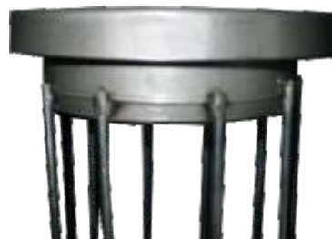
Spun top cap