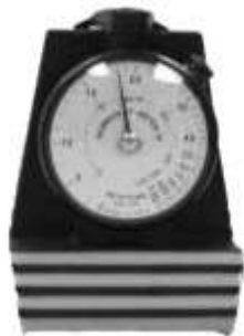
Newman ST-Meter 1-E