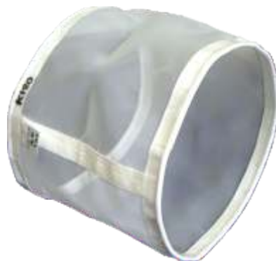
Rotary sifter screen