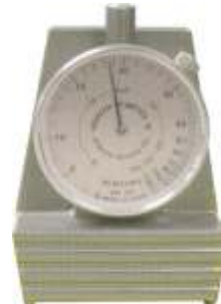
Newman ST-Meter 2-E